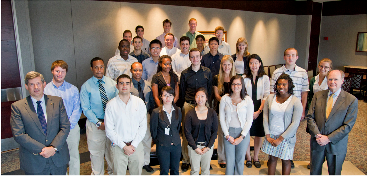
Participants in the Bank's 2012 intern program

Third District, including those who work in inner-city, girls', and majority minority high schools.