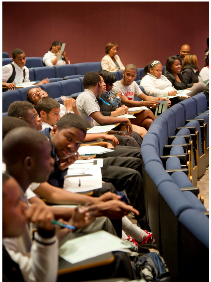
Participants in the Congressional Black Caucus Youth Leadership Summit