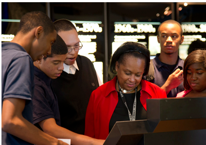
Participants in the Congressional Black Caucus Youth Leadership Summit

The Federal Reserve Bank of Philadelphia, along with the other regional Reserve Banks, is supported by the National Procurement Office (NPO). The NPO is a procurement function within the Federal Reserve System that develops and executes national contracts for certain goods and services that, when purchased collectively, provide the best value for multiple Reserve Banks. The Reserve Banks work together to identify opportunities to further the System's supplier diversity programs, practices, and actions. This includes coordinating national outreach efforts as well as participating in national supplier diversity conferences. In 2012, the Federal Reserve System collaboratively participated in two supplier diversity conferences to reach minority- and women-owned firms. The conferences attended were sponsored by the Women's Business Enterprise National Council (WBENC) and the National Minority Supplier Development Council (NMSDC).