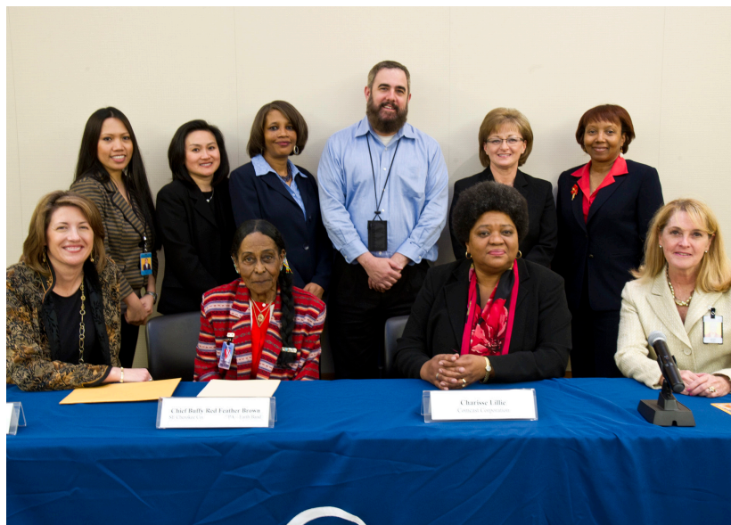
Members of the Bank’s Diversity Council with participants in the program held at the Bank to mark Women’s History Month