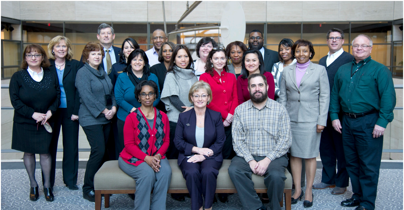
Members of the Bank's Diversity Council